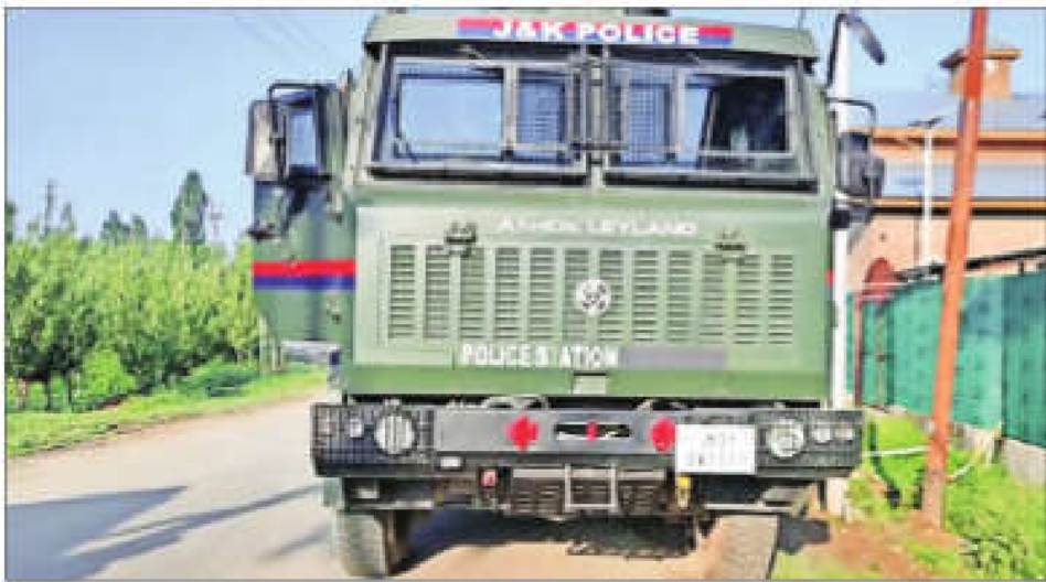
A security vehicle is seen during raids conducted by the SIA across multiple locations, in Kulgam district on Sunday

"Technical intelligence indicated that a host of sleeper cells in Kashmir were in direct contact with their handlers based in Pakistan and were involved in conveying sensitive and strategic information about security forces and vital installations via messaging apps including but not limited to WhatsApp, Telegram, Signal and soon."